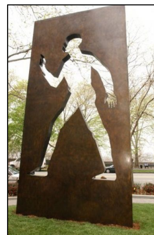
Ralph Ellison Memorial in New York City